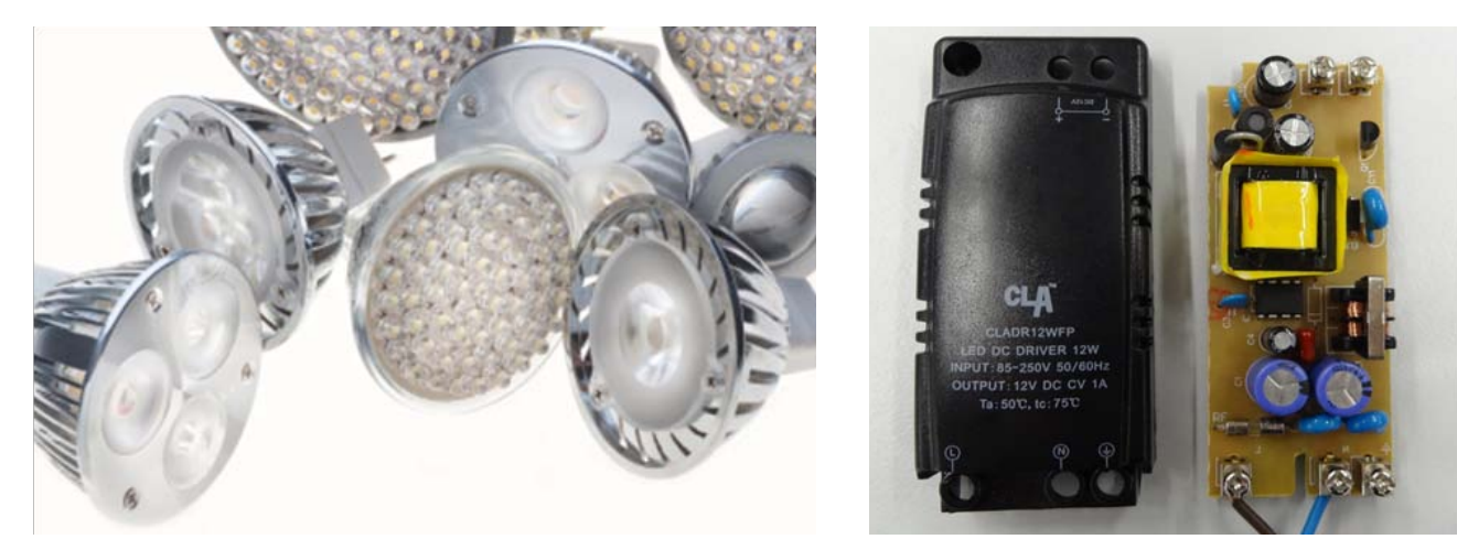
Figure 6: LED Lamps [5]

The susceptibility of LED lighting systems to power quality disturbances is highly complex and is very much dependant on the design of the driver circuit. Some driver circuits react differently to the various power quality disturbances compared to others. It has been found that some LED lighting systems are highly susceptible to changes in the supply voltage magnitude, while others appear to have high immunity. It has also been found that the complex relationship between LED lamps, driver circuits and dimmers can be highly susceptible to waveform distortion in some cases. Overall, it is difficult to make definitive statements with respect to the impact of power quality disturbances on LED lighting systems.