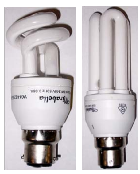
Figure 3: CFL Globes

With the phasing out of standard incandescent bulbs in many countries, penetration of CFLs, which were the only viable alternative at the time, has increased exponentially. There are many variants of CFL globe both in terms of construction and bulb power rating. CFLs contain a complex electronic ballast for starting. Figure 3 shows images of two different CFL lamps. Figure 4 shows a typical CFL ballast circuit while Figure 5 shows a dismantled CFL with the complex ballast circuit clearly visible. The main power quality disturbances that impact the performance of CFL lighting technology are supply voltage magnitude, voltage sags and rapid voltage change.