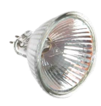
Figure 1: Incandescent Light Bulb [1]