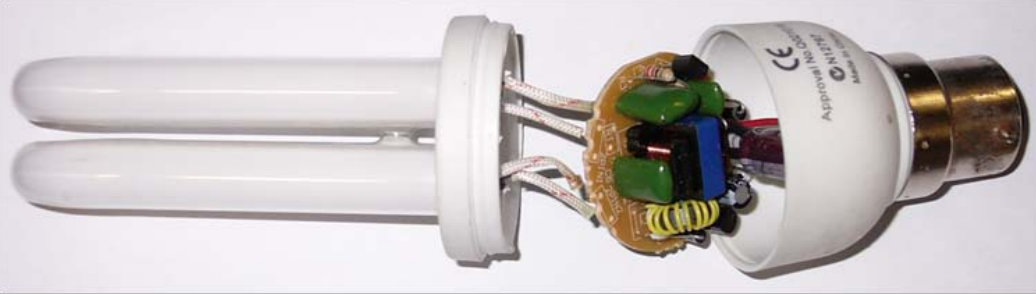
Figure 5: Dismantled CFL showing Complex Ballast Circuit