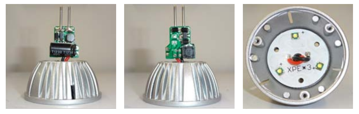
Figure 8: (a) and (b) LED Lamp and Regulation Circuits, (c) 3 LEDs in Series